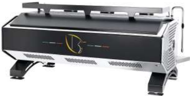
Stainless Steel / Matte Black