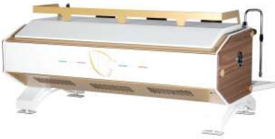
Nut Wood / Matte White